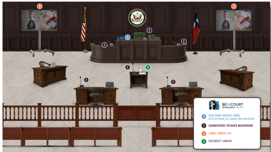
EASYCOURT - Essential AV Package

EASYCOURT by BEINCOURT redefines courtroom technology, focusing specifically on advanced audio and video solutions. Our Effortless Assembly System (EASY) courtroom dismantles the complexity and high costs typically associated with courtroom AV technology, offering an accessible, streamlined hybrid approach for today's hearing rooms and courtrooms.